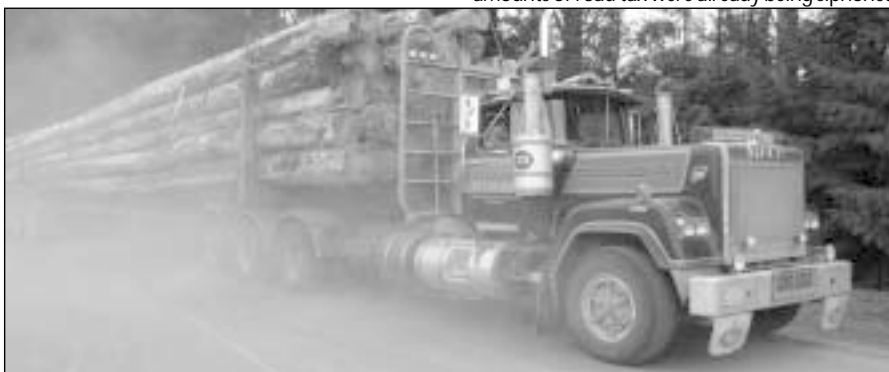
NZFOA is concerned road tax will continue to be siphoned off for non-roading purposes under proposed legislation

"If we do not address this issue directly, the regions requiring growth and new jobs will suffer. We hope the Government will seriously reconsider the Bill and make significant changes so the country can have safe and efficient roads." ■