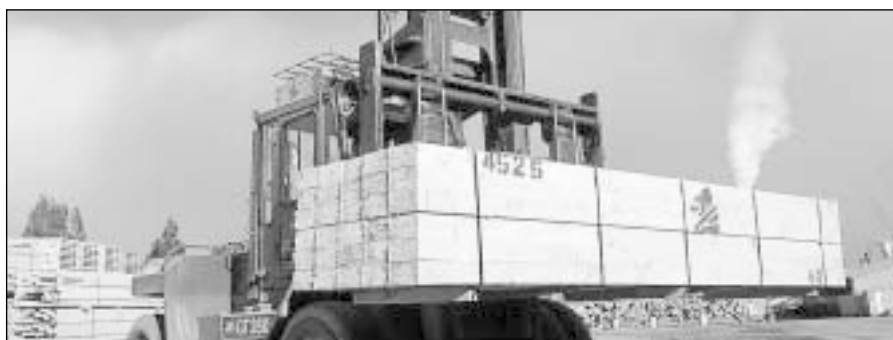
Fletcher Challenge Forests

"NZFIC has been working with the Building Industry Federation on a consumer information campaign which will be released soon. We will also co-operate with government agencies as they work through the implications of ERMA's report." ■