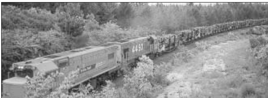
Fletcher Challenge Forests