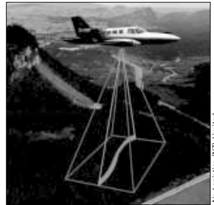
A CASI-2 camera is used to scan the forest