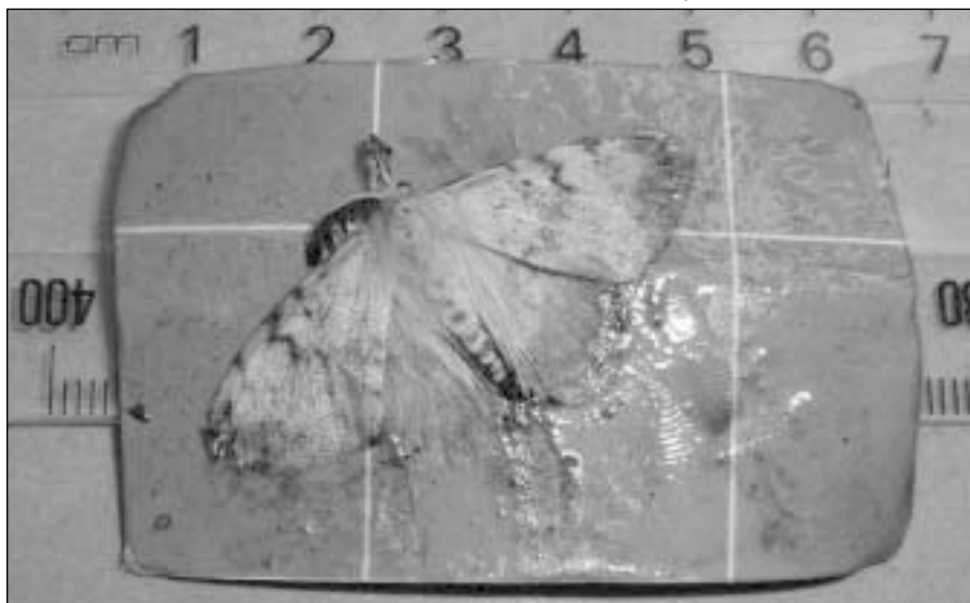
The hunt is still on for relatives of the Asian gypsy moth caught in Hamilton in March

He says the Asian form of gypsy moth is known to feed on pinus species, which puts the forest industry at risk. ■