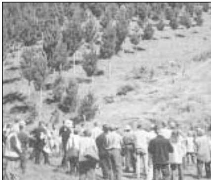
UNFF delegates get a close up look at New Zealand's plantation forests

International experts on forestry attended a subsidiary meeting of the United Nations Forum on Forests (UNFF) held in New Zealand in March to discuss the role of planted forests in sustainable forest management.