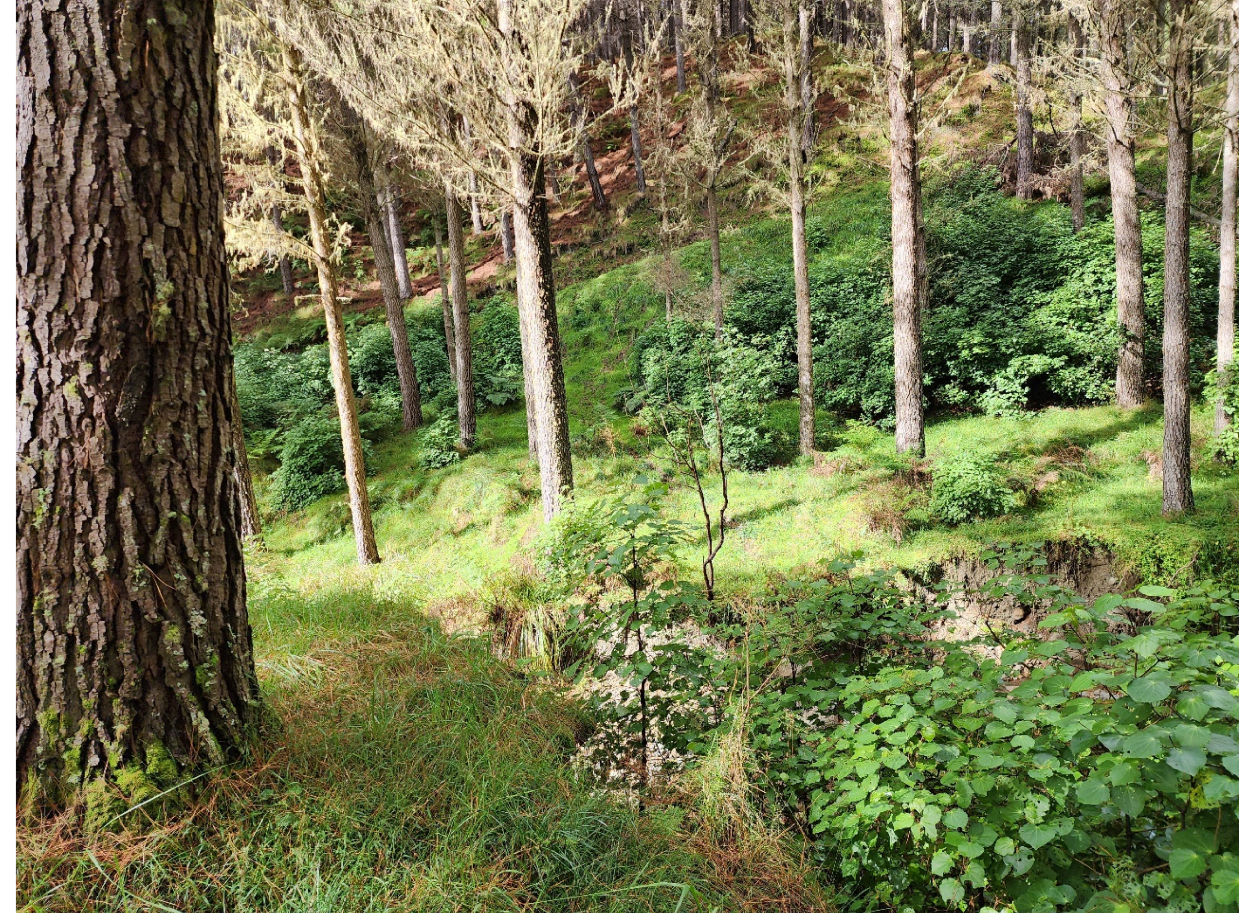
Trees showing excellent form and growth. April 2023