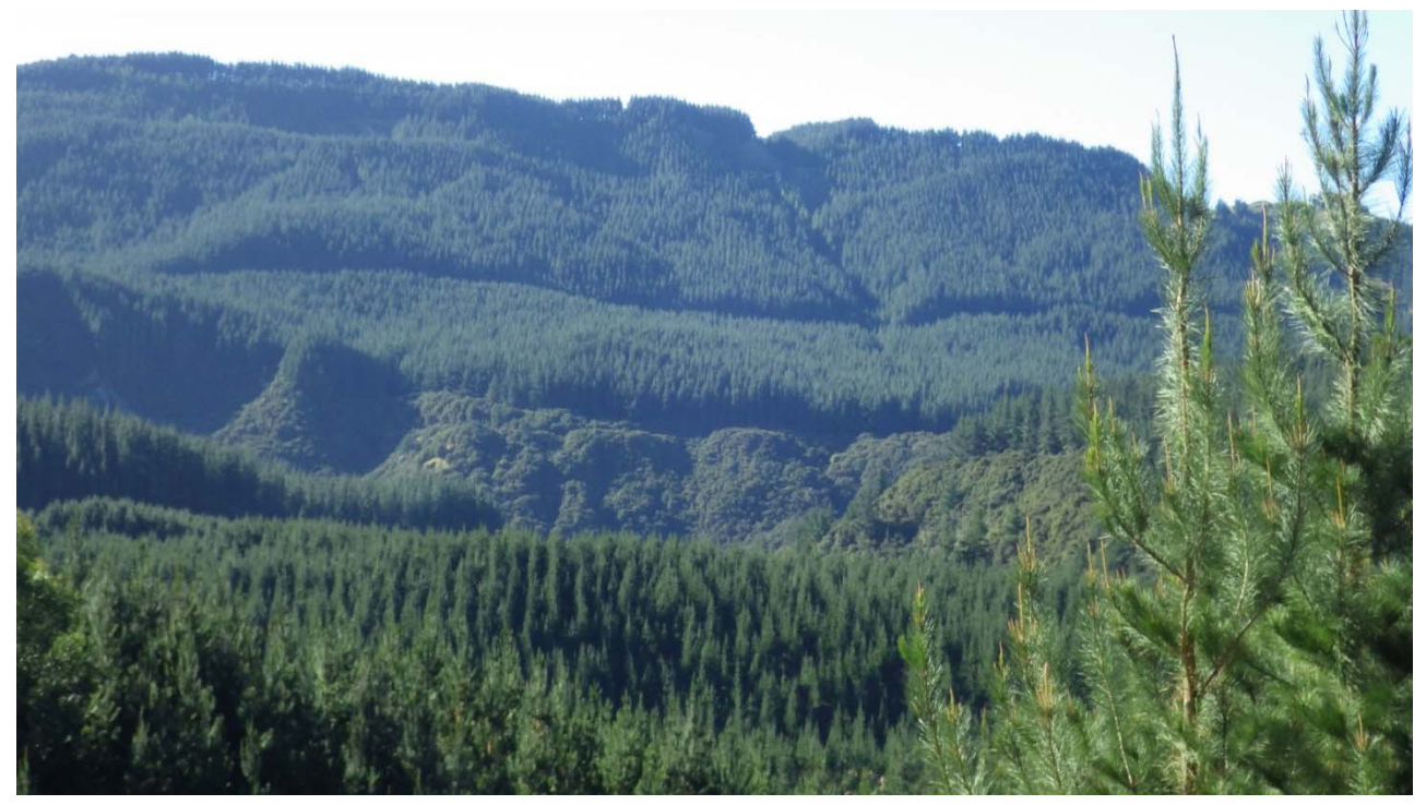
Looking North-East towards a neighbouring forest.

NOTE: Future Calls and Distributions in the Cashflow Projection should be taken as a guide only. Due to harvest practicalities, it is likely that Distributions will be spread over several years.