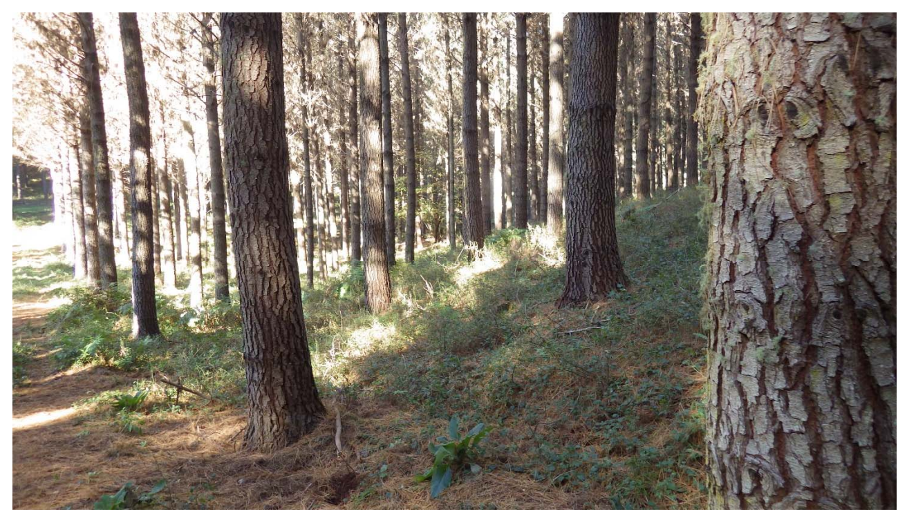
Well-established trees on a main access track.