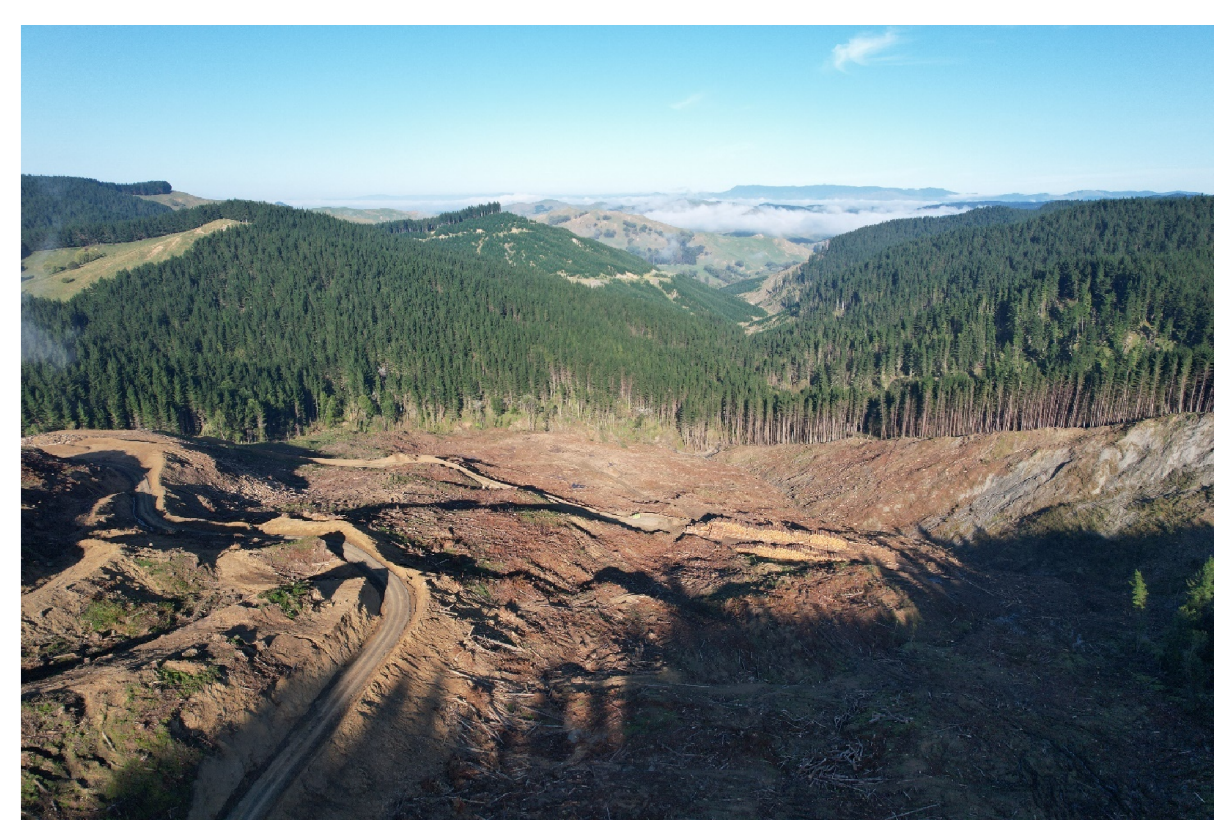
NES-CF compliant harvesting to mitigate migration of harvest residue. March 2023