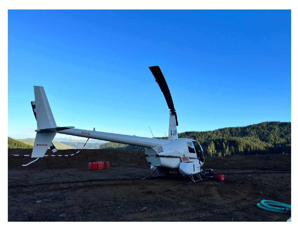
Desiccation spraying, April 2023.