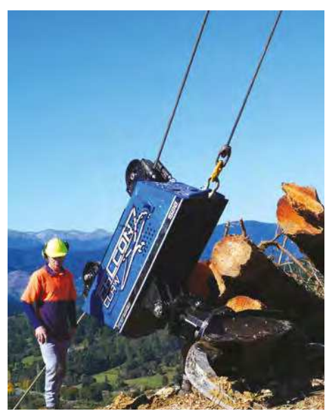
Technologies making steepland harvesting safer

FISC also runs the Safetree.nz website, which provides tailor-made safety information for forest workers.