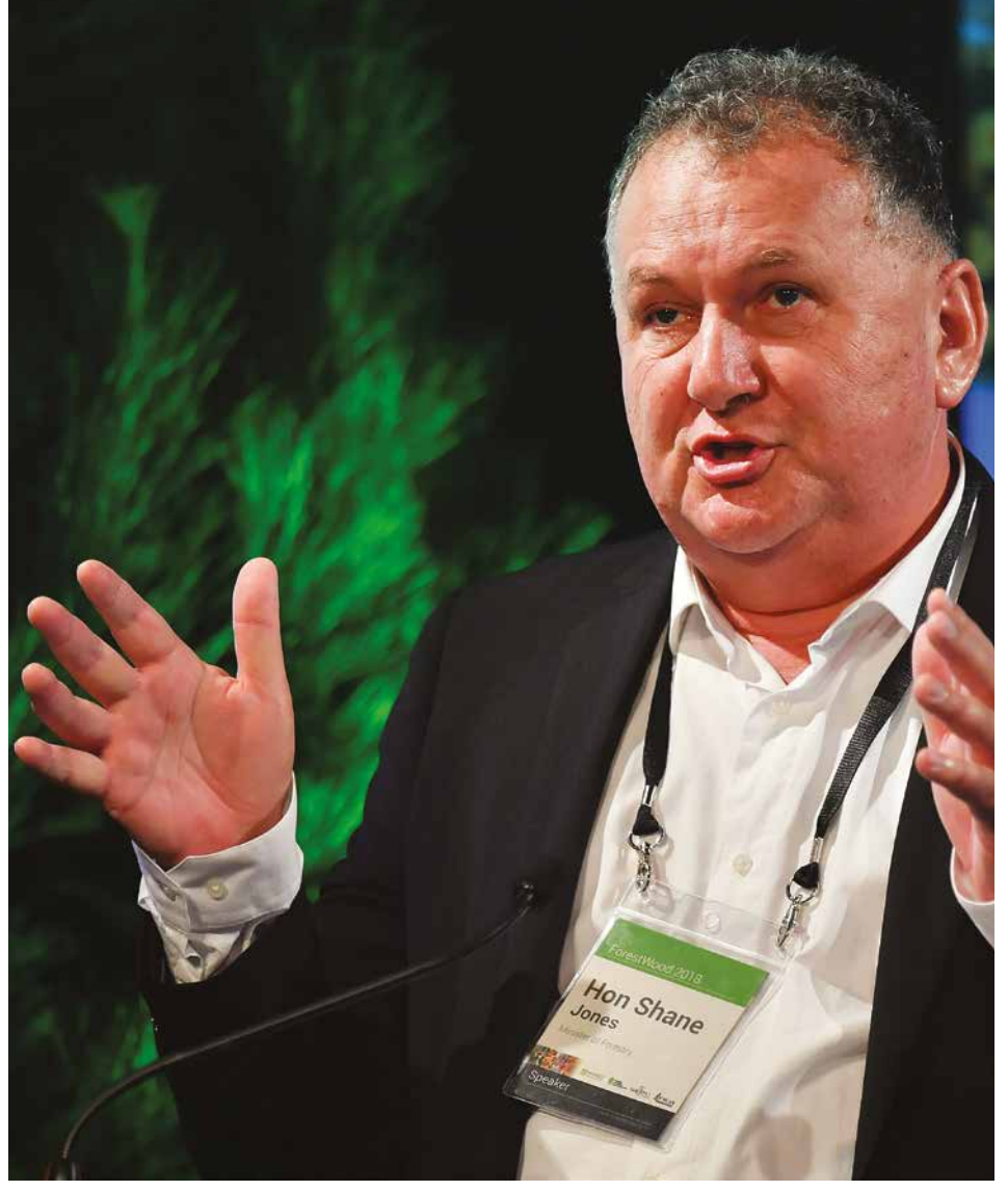
Forestry Minister Shane Jones "I am an industry man... but also a Māori and a politician... The new Forestry Agency, extracted from MPI, will have a Māori name, Te Uru Rākau, which means 'chief tree', or in Jones' case 'big stick'."