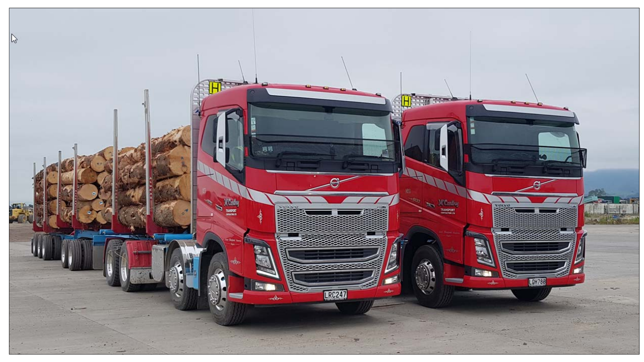
Photo 3: New 58 Tonne trucks on the road November 2018.

Trial loads of the new 58 tonne heavy trucks to Wellington, reducing the number of log trucks on roads.