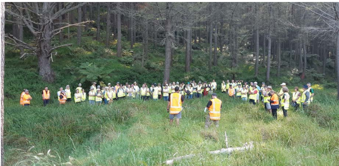
Investors at forest visit