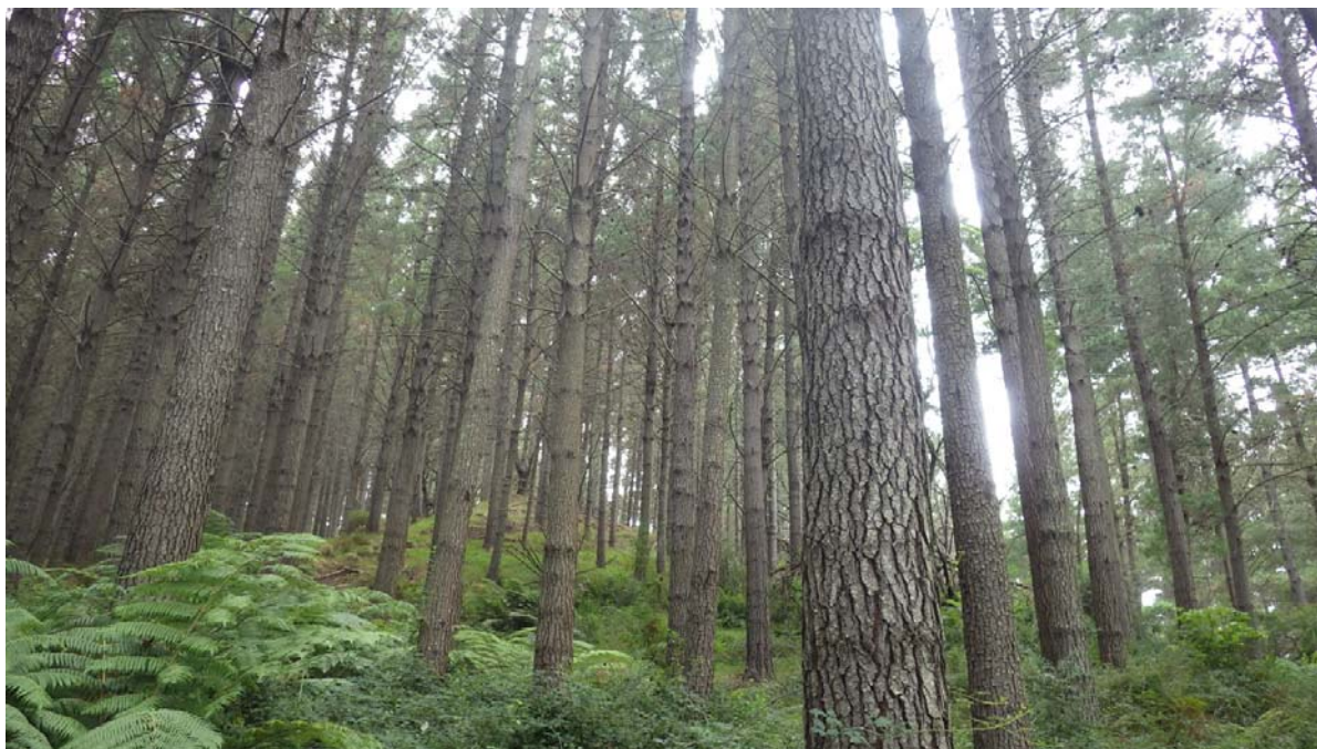
Trees showing good growth and form

Due to harvest practicalities, it is likely that Distributions will be spread over several years.