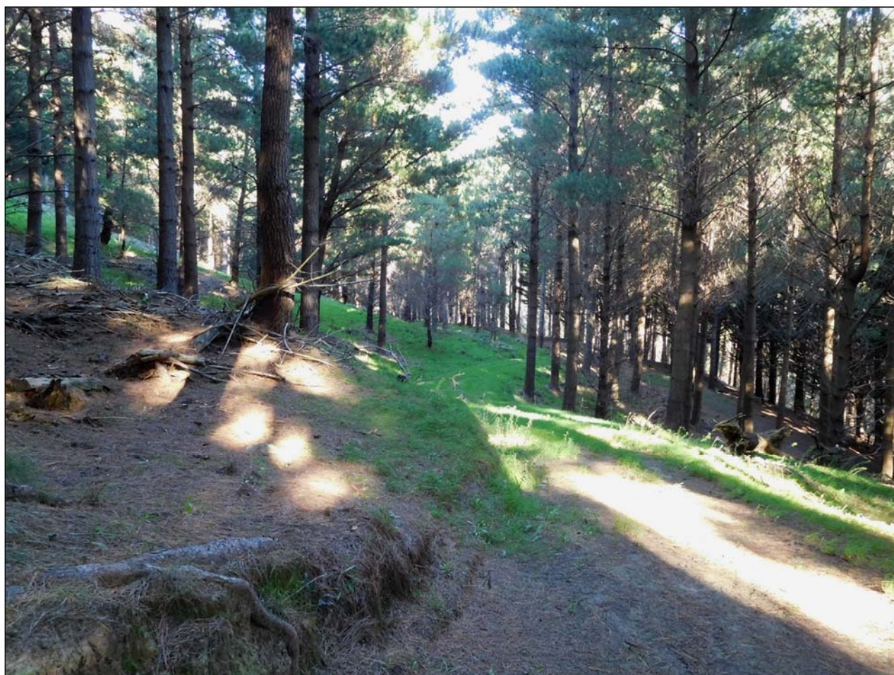
A well-established stand of trees adjacent to an access track.