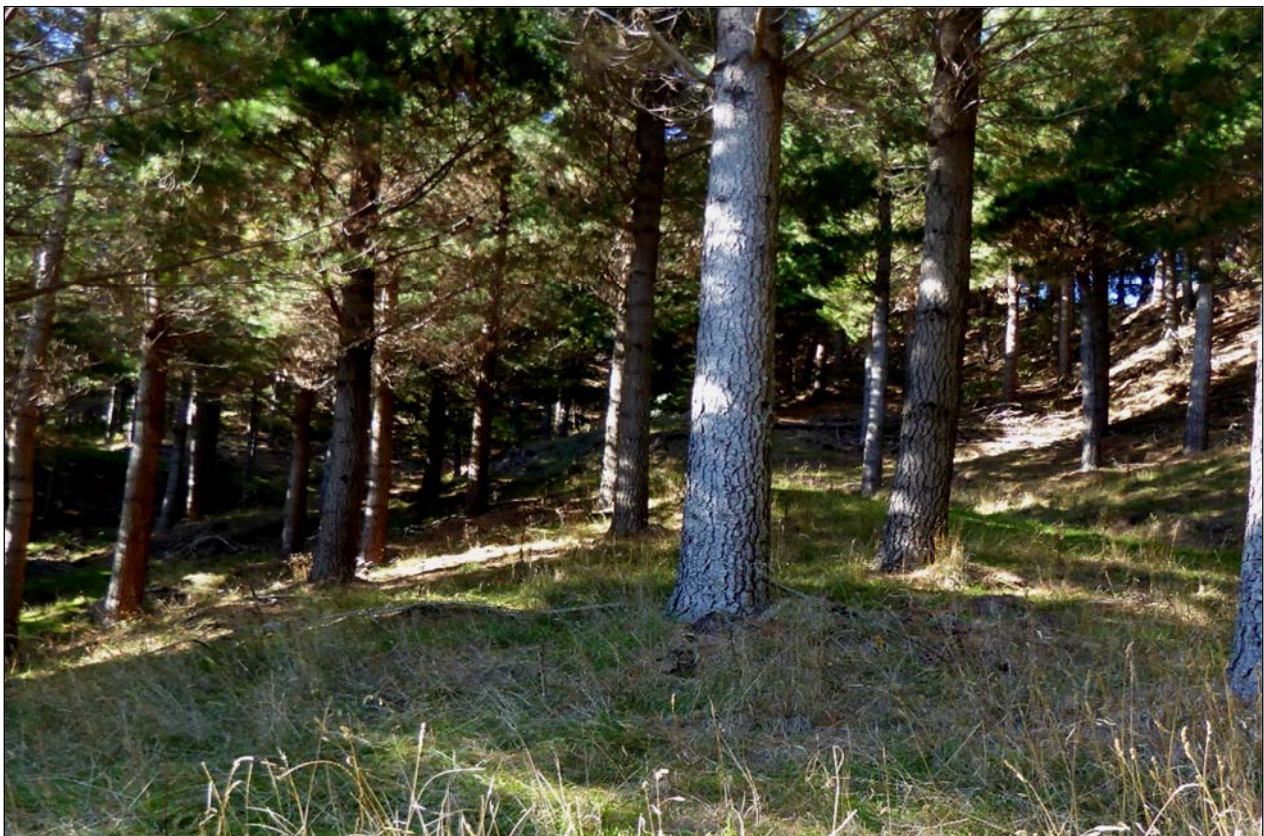
A well-established stand of trees with the canopy starting to close over.

This report is specific to matters pertaining to your forest, with items of a more general nature, and industry comment being covered in our regular Forest Enterprises Investor Communications.