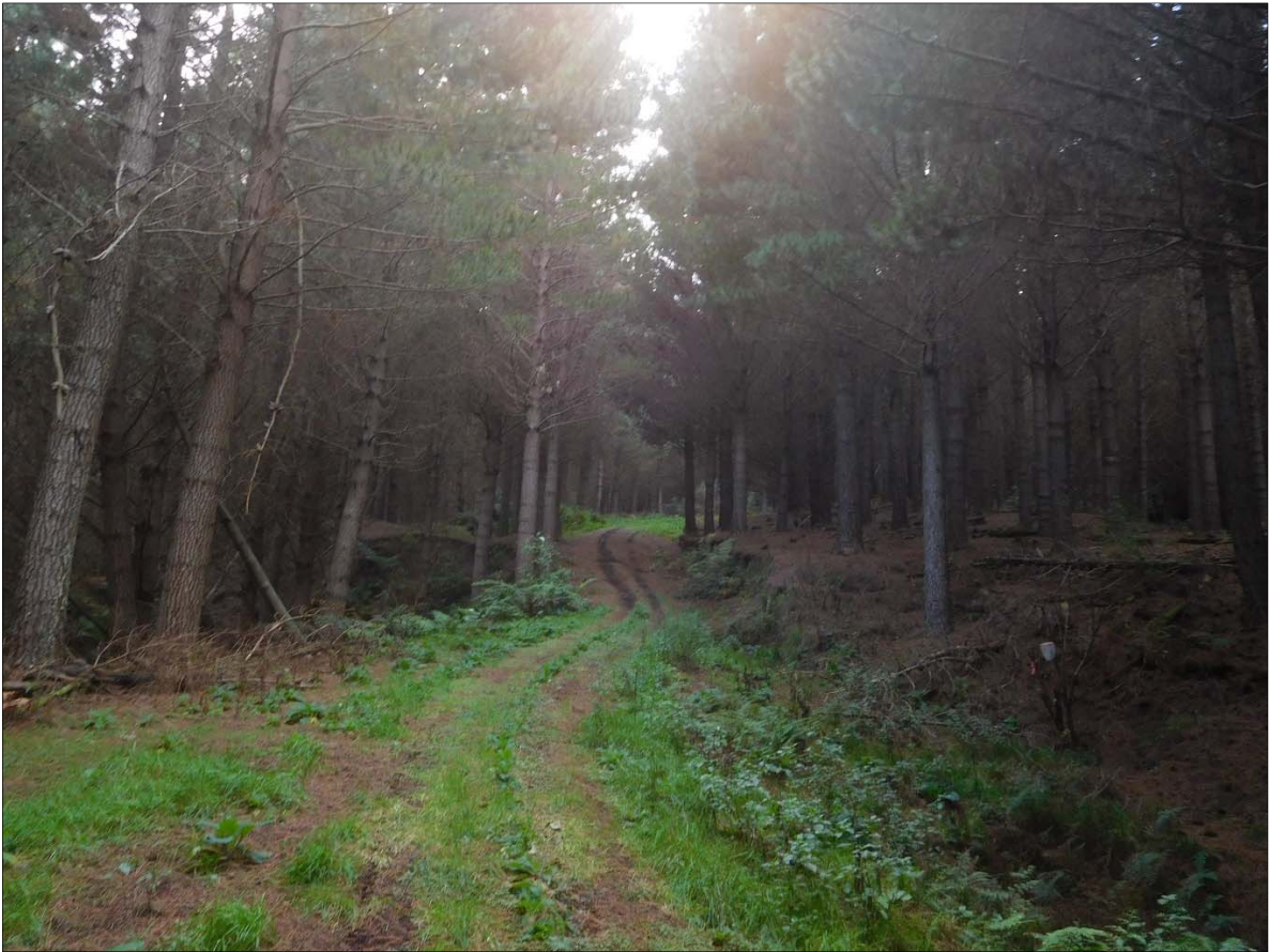
Main access Track.