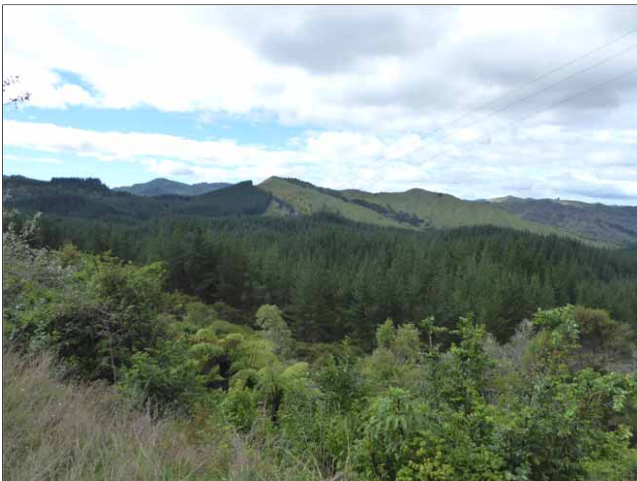
View of part of the forest from Kanakanaia Road.