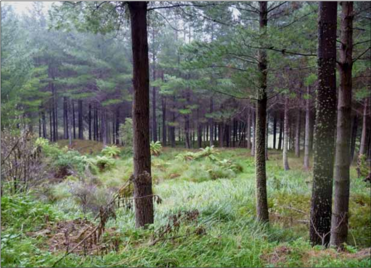
A stand of trees planted in 1996.