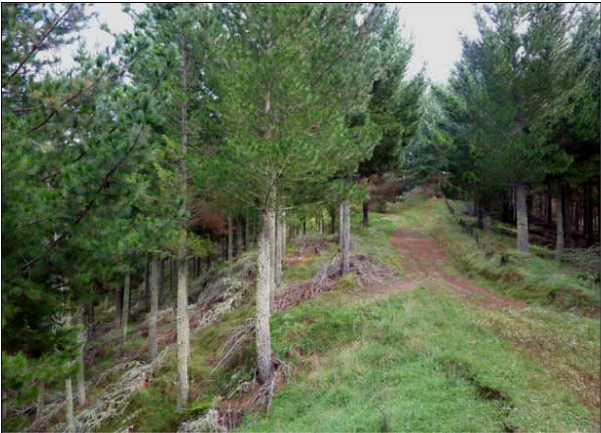
Looking into the 1997 stand from a main access track.