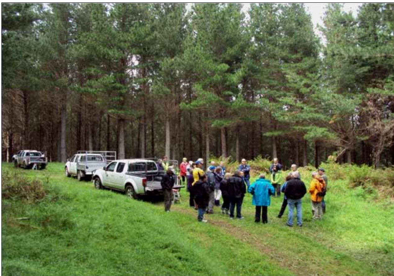
Group of investors at the last combined Greenhills/Woodgate forest visit and informal meeting.

NOTE: Future Calls in the Cashflow Projection should be taken as a guide only, as they can and will change.