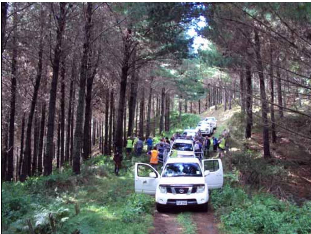
Group of investors at the last forest visit on a main access track within the forest.

This report is specific to matters pertaining to your forest, with items of a more general nature, and industry comment being covered in our regular Forest Enterprises Investor Communications.