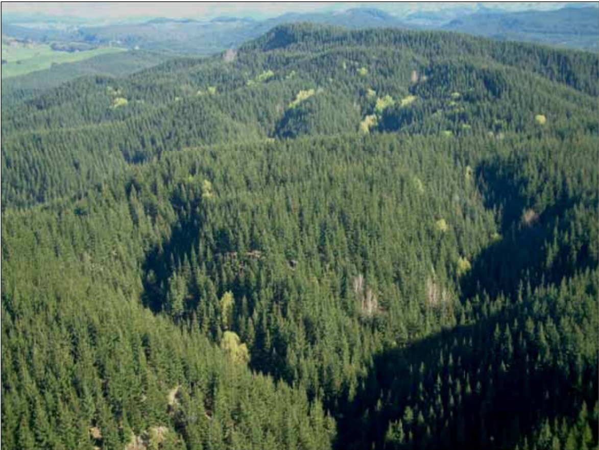
Aerial view looking west over the forest.