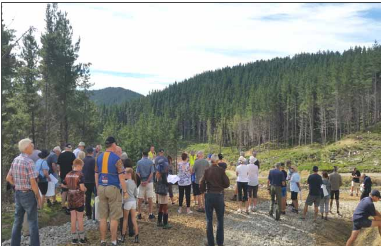
Group of investors standing on the newly formed harvest road, overlooking part of the forest.