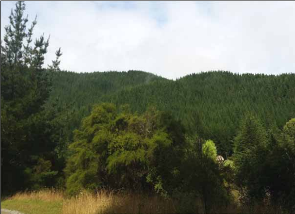
View of the 1997 age class from the Kanakanaia Road.