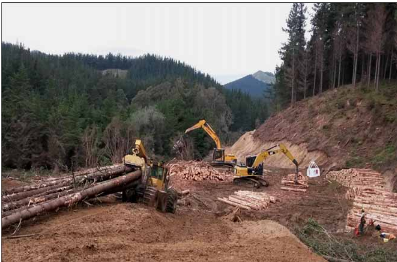
Skidder pulling cut trees to the landing for processing into logs, which are then stacked ready for loading onto trucks. Photo April 2016

NOTE: Future Calls in the Cashflow Projection should be taken as a guide only, as they can and will change.