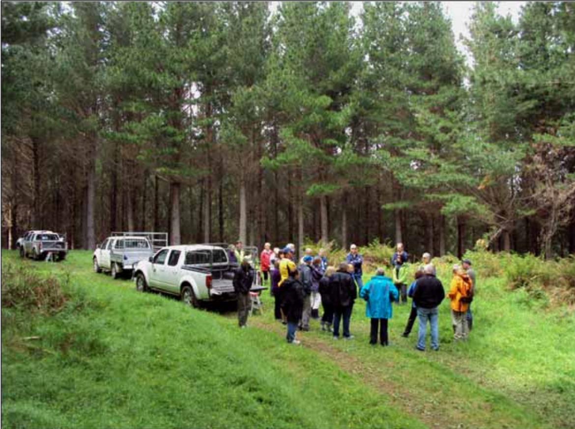
Group of investors at a combined Greenhills/Woodgate forest visit.