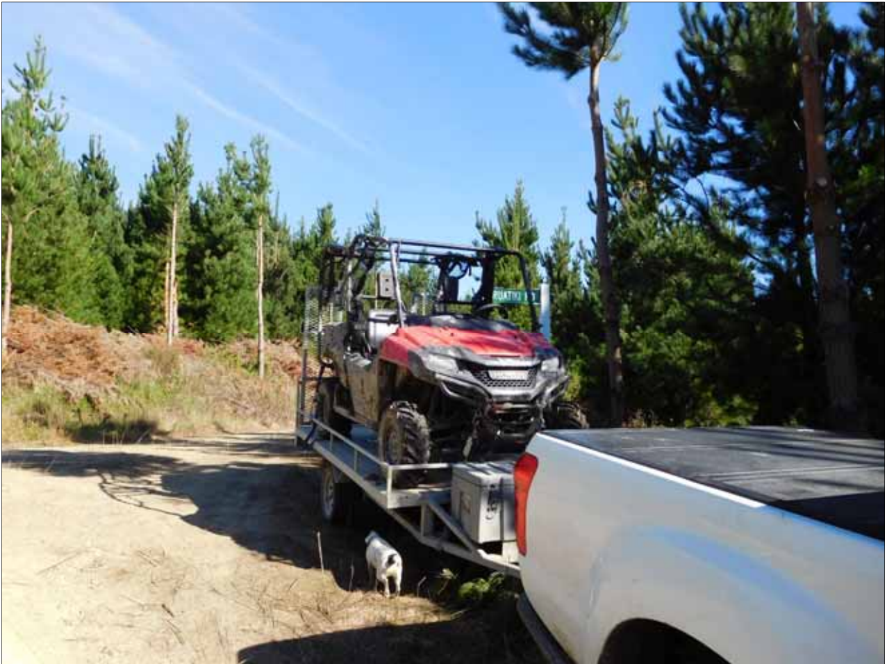
Cnr Ruatiki and Ridge Roads during annual forest audit. Photo April 2017