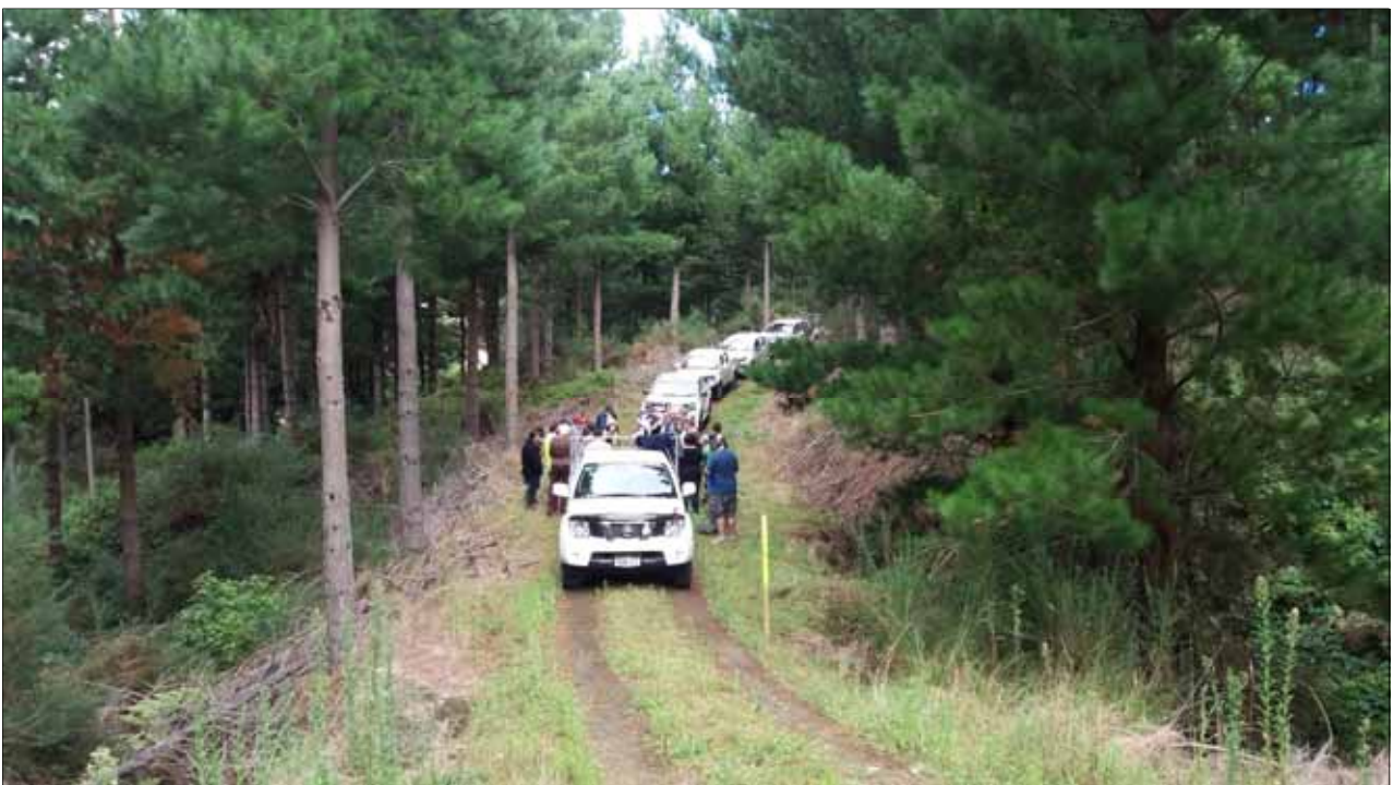
Investors amongst a pruned stand, listening to an update from the Forestry Team during a Forest Visit. Photo March 2016