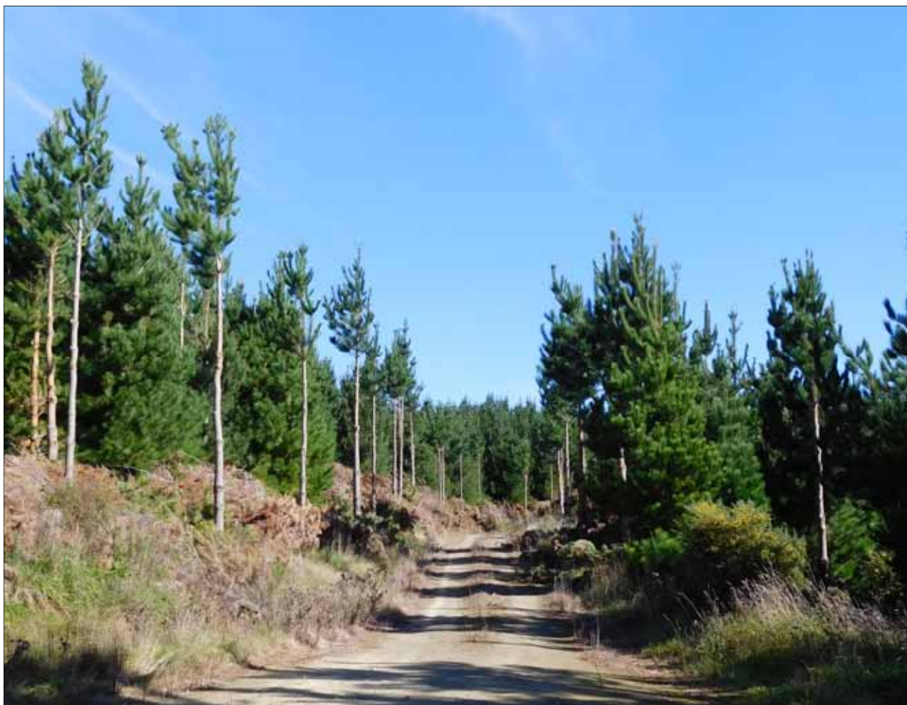
Ridge Road. Photo April 2017