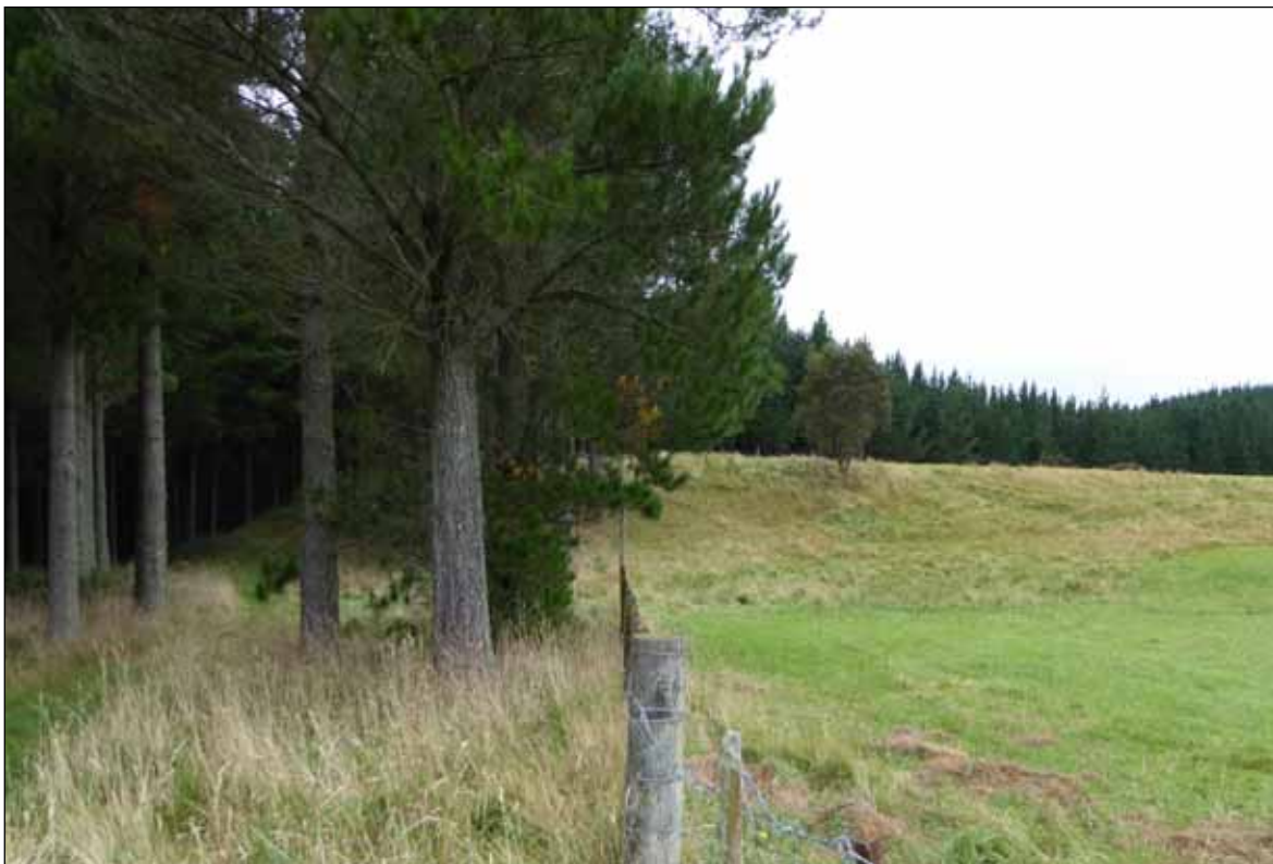
Trees on the eastern boundary of the forest.

This report is specific to matters pertaining to your forest, with items of a more general nature, and industry comment being covered in our regular Forest Enterprises Investor Communications.