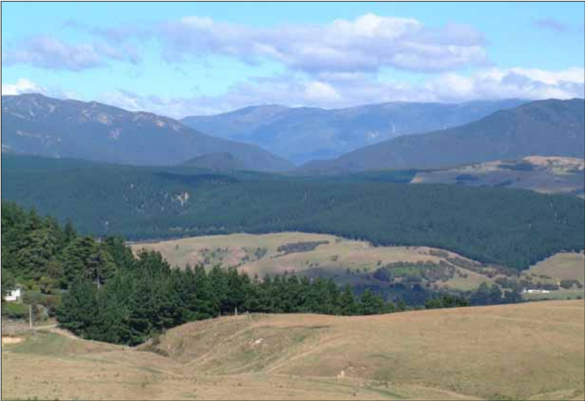
View of the forest looking west from Glenross Road, with the Kaweka Ranges in the background Photo February 2008