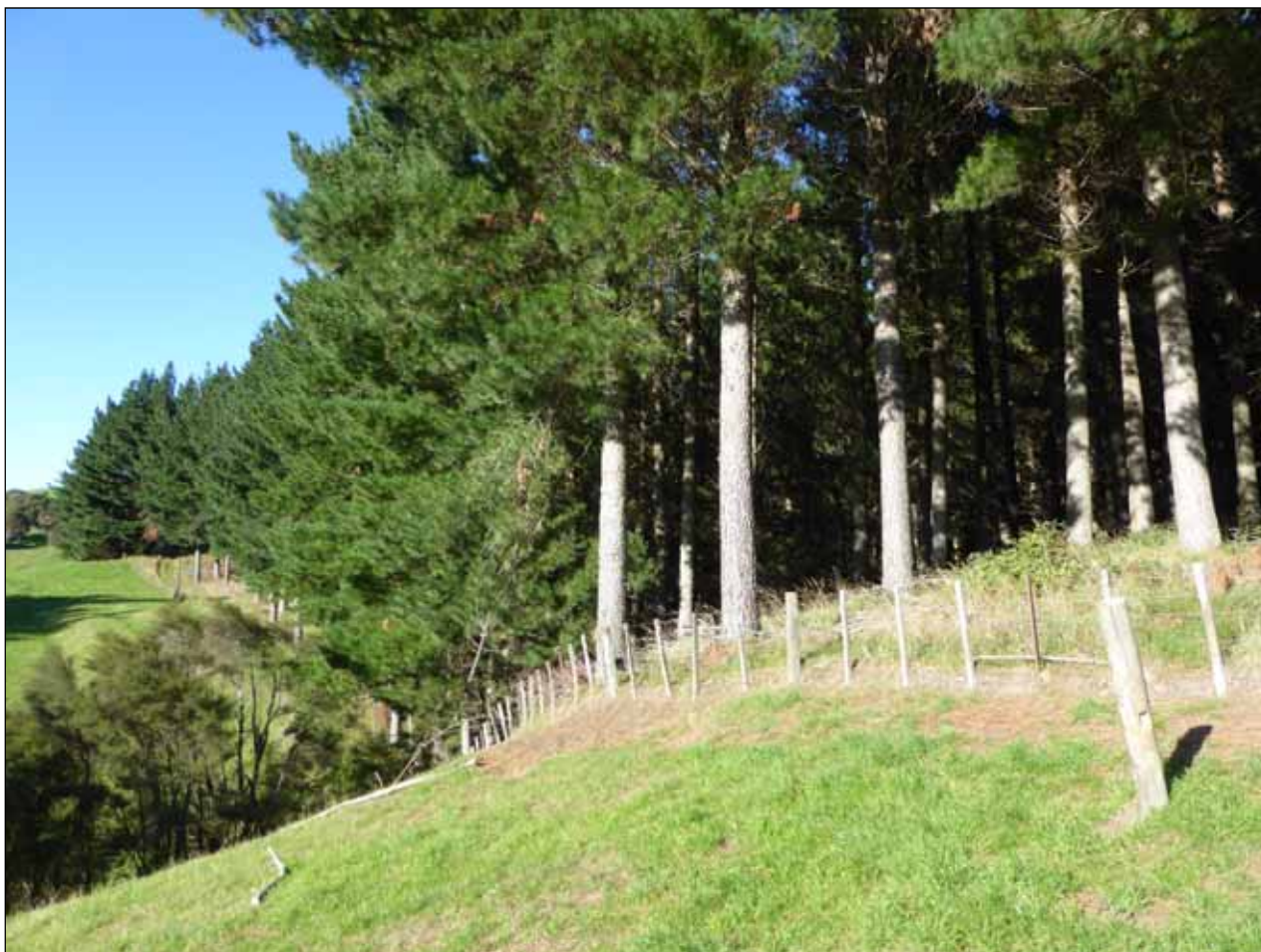
A well-established stand of trees at the edge of the forest, next to Glenross Road.