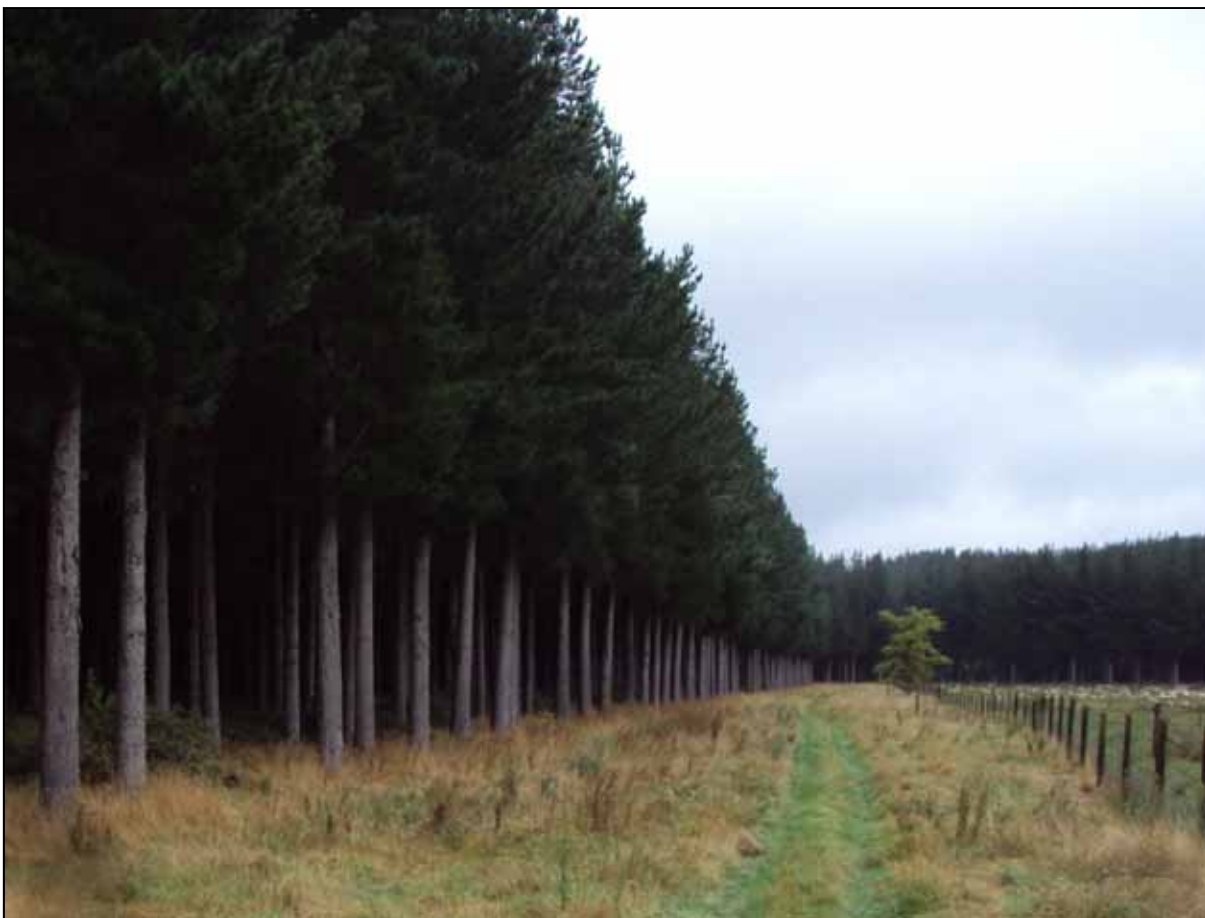
Trees planted in 1997 on the eastern boundary of the forest showing good growth and form.

NOTE: Future Calls in the Cashflow Projection should be taken as a guide only, as they can and will change.