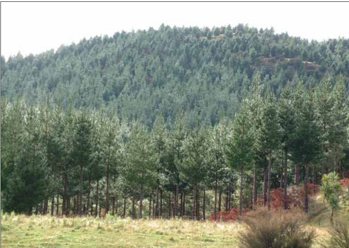
View of part of the 1997 stand looking north from the farm boundary. Photo March 2007