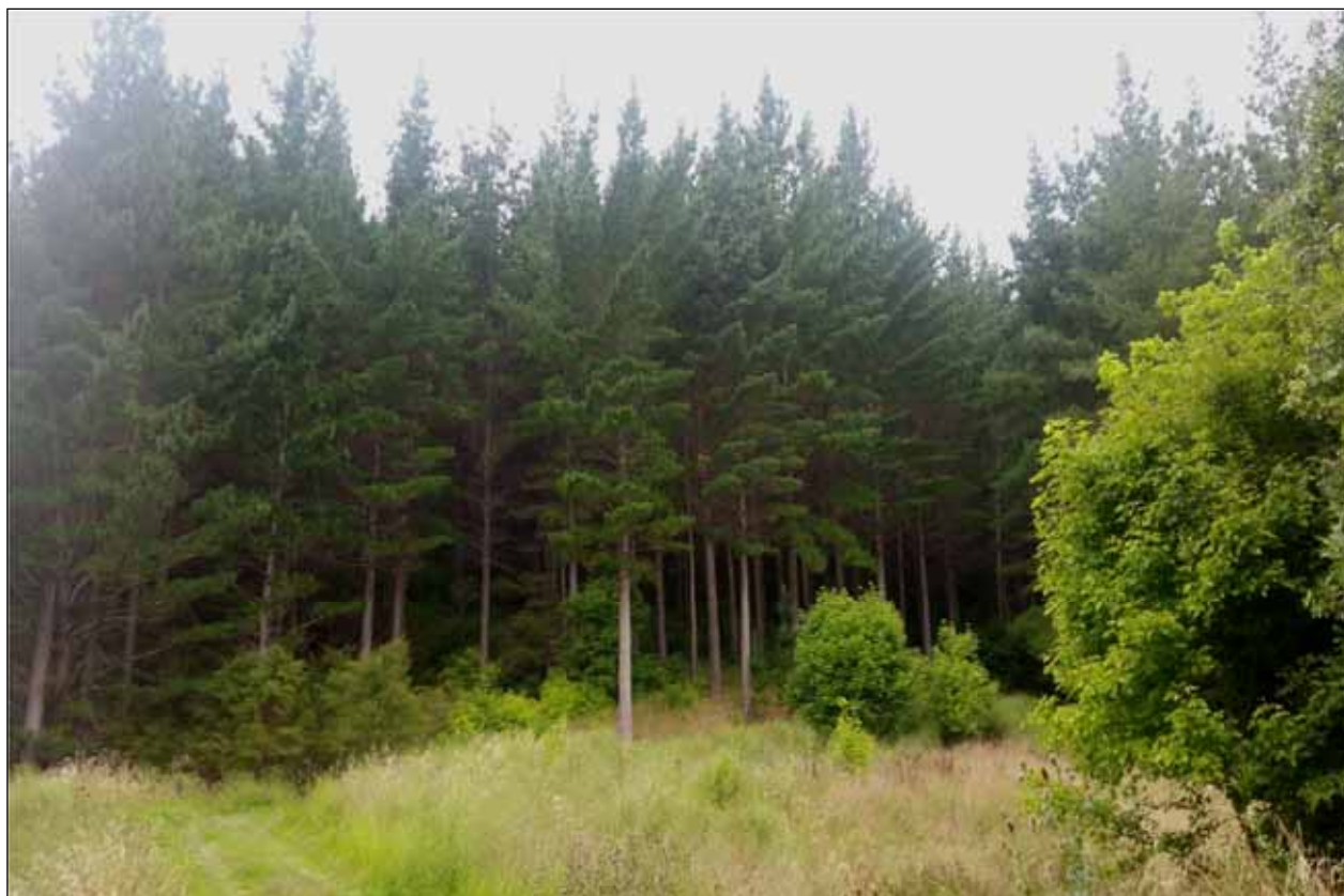
Another entrance track to both the Broadview and Springhill Forests.

NOTE: Future Calls in the Cashflow Projection should be taken as a guide only, as they can and will change.