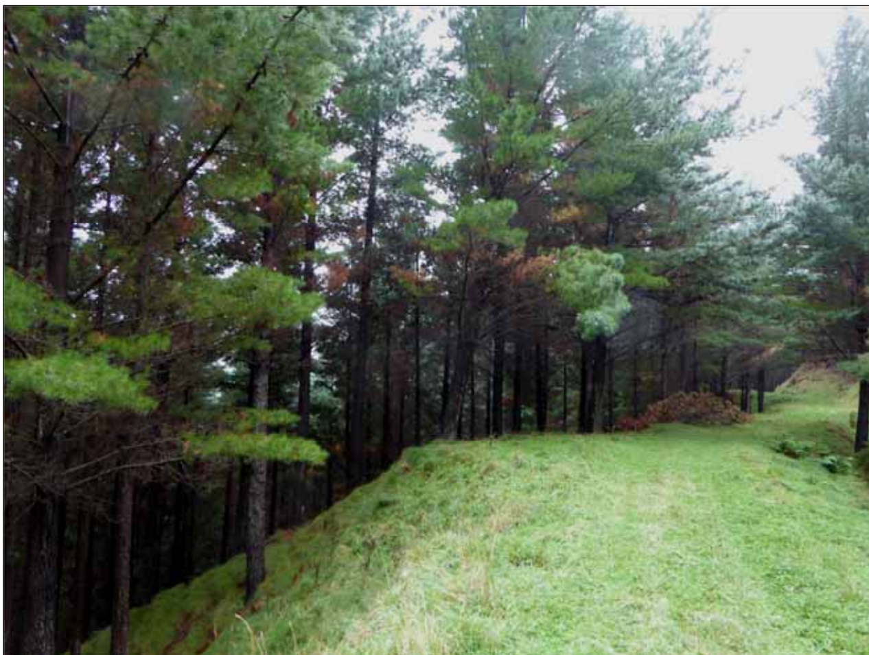
Looking into a well-established stand of trees, from a main access track.