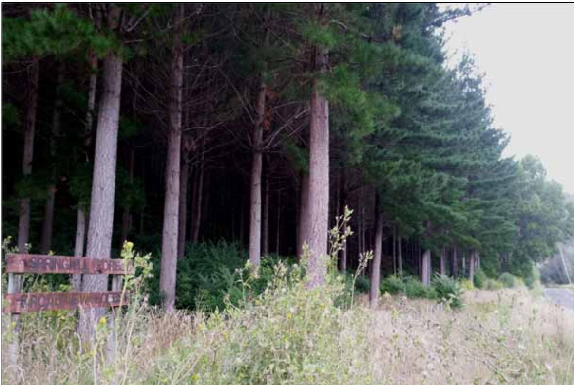
Entrance to the Broadview and Springhill Forests from Waimata Road.

This report is specific to matters pertaining to your forest, with items of a more general nature, and industry comment being covered in our regular Forest Enterprises Investor Communications.