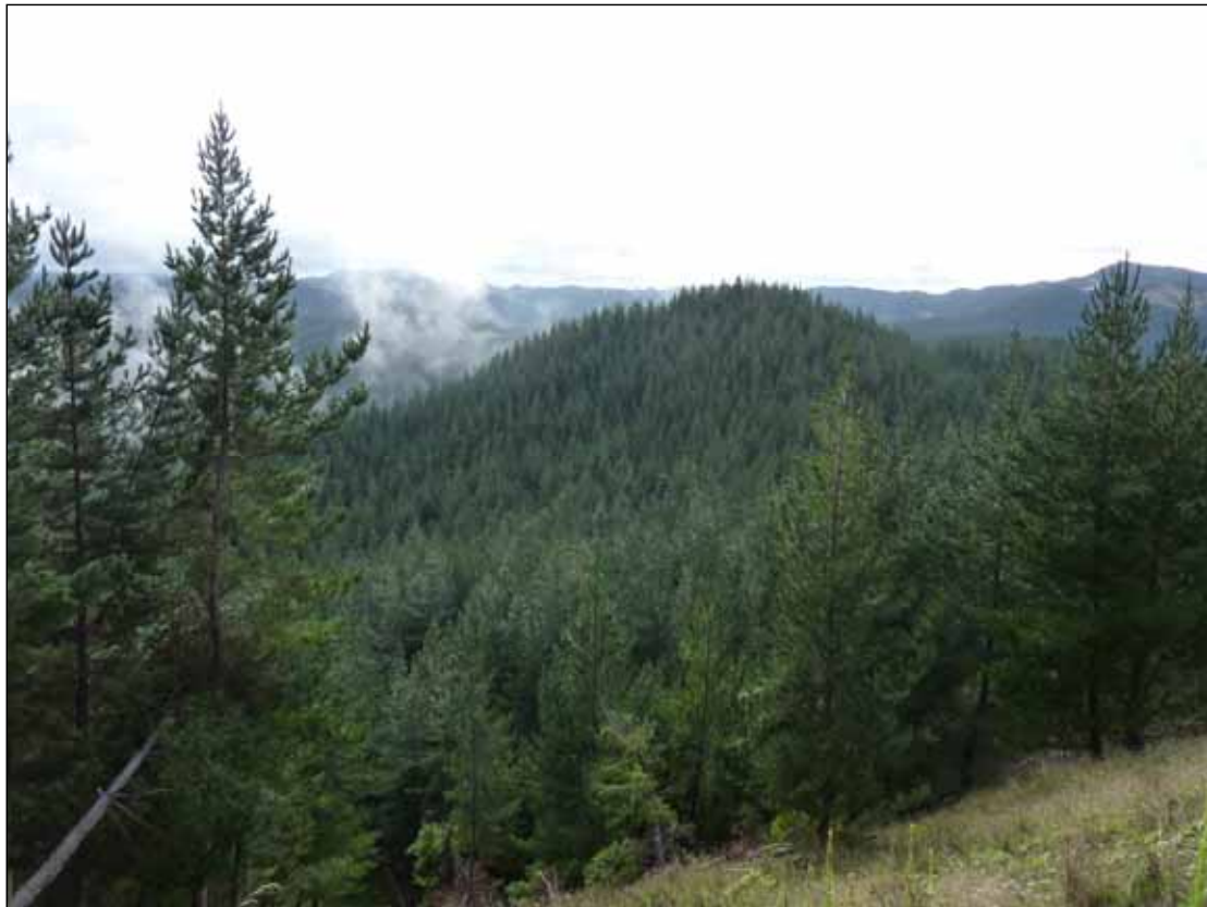
Looking over the 1995 plantings from the Waimata Road.